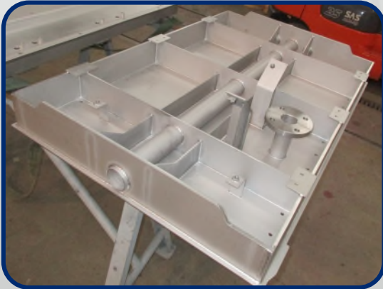
Gate, wet side